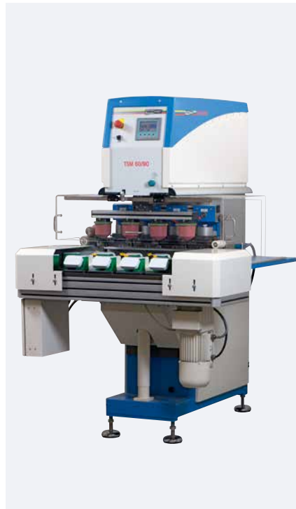
TSM 60/90 universal multiple color kit Solo