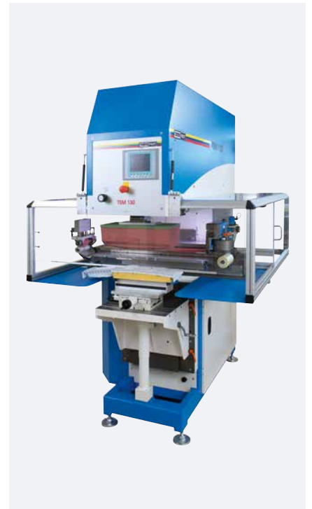
TSM 130 universal transverse doctor kit