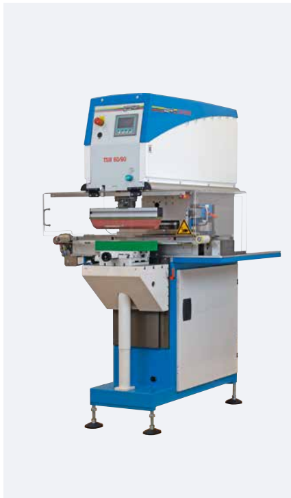
TSM 60/90 universal transverse doctor kit

Versions with servomechanical drive are characterized by a very high number of cycles and a very high force of pressure. Energy-efficient cinematics in doctor or pad movement and a resource-saving machine frame construction round off the successful machine concept.