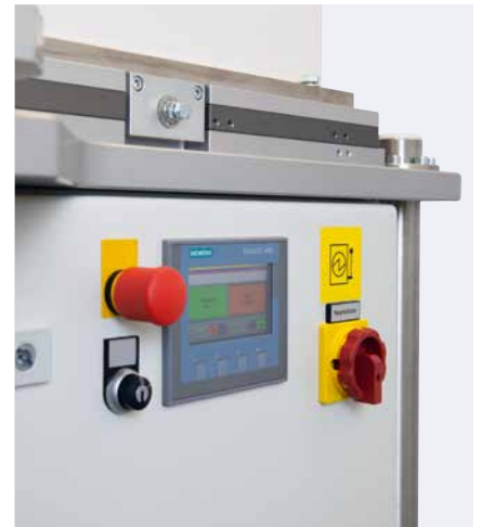
Touch panel for the operation of the index table

The height adjustable angle table with the useful storage area allows the printing of