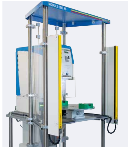
Light curtain, rotary index table, angle table

The MODULE ONE XS consists basically of a compact frame, a safety enclosure as well as the four standardized components: Rotary index table, light curtain, angle table and cross slide. The pad printing machine will be individually selected from the machine series HERMETIC, SEALED INK CUP E and V-DUO.